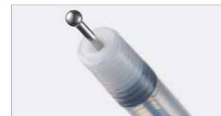
Evolved tip design of FlushKnife BT

FlushKnife BT has a ball tip, which produces good traction, enabling the target tissue to be dissected smoothly. The ball tip touches a wider part of the tissue and arrests bleeding more efficiently.